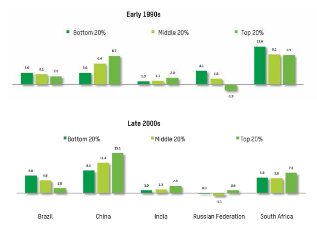
Figure 2. Change in real household income by quintile Average annual change in %